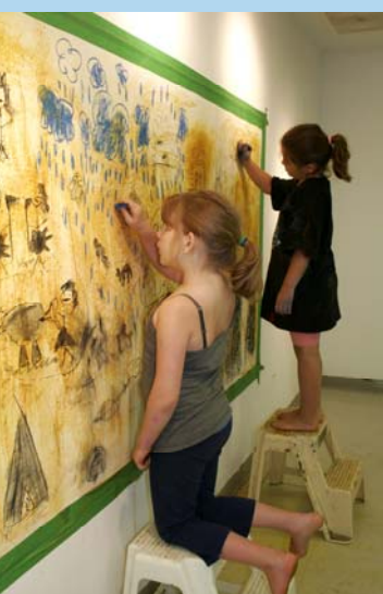
YOUNG ARTISTS AT WORK DURING SUMMER ART CLASSES AT THE TOM

Spring session: March 24-May 5 (no class Apr 7)